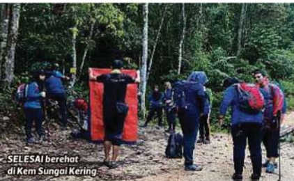
SELESAI berehat di Kem Sungai Kering.