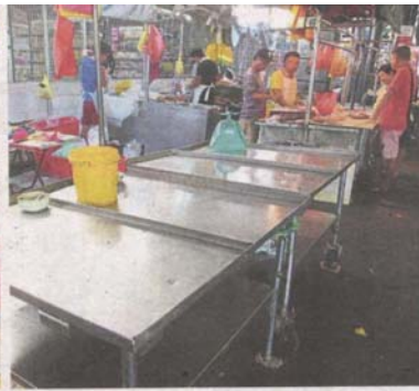
Wet markets on the street like this one in SS2, Petaling Jaya must close during the restriction period.