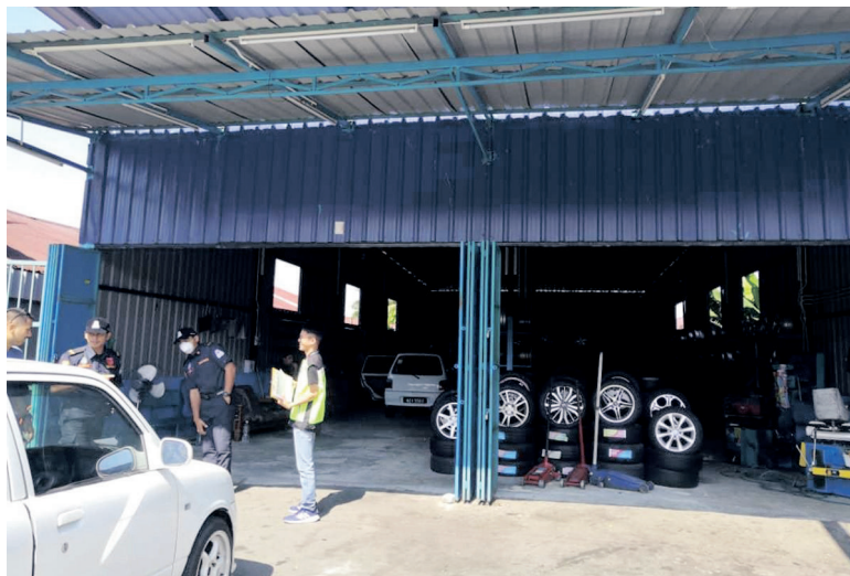
Pegawai MPS menjalankan pemantauan pematuan Perintah Kawalan Pergerakan di sekitar Selayang semalam.

Bagaimanapun, terdapat 25 sektor dikecualikan daripada perintah itu antaranya air, elektrik, tenaga dan telekomunikasi selain penyiaran serta kesihatan.