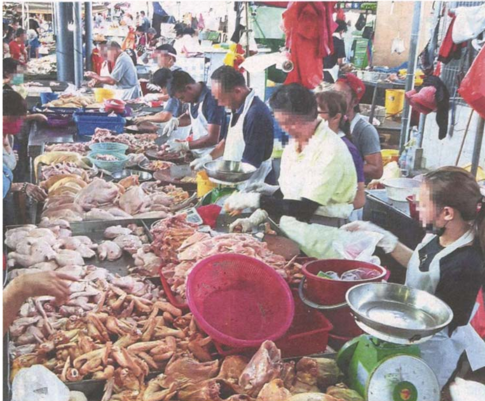
fresh produce at a market in Petaling Jaya.

Provided for client's internal research purposes only. May not be further copied, distributed, sold or published in any form without the prior consent of the copyright owner.