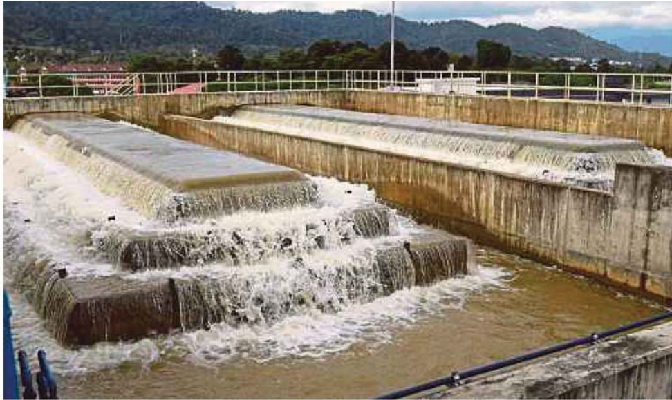
The pollutant which shut down four water purification plants in Rawang, Selangor, is believed to have originated from the Sungai Bakau industrial area.