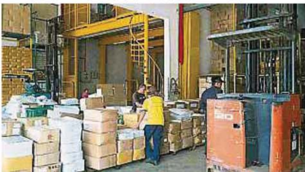
江鱼仔批发厂并未停工, 遭到市议会的严厉警告, 若再犯有关业者将面对两年监禁的刑罚。