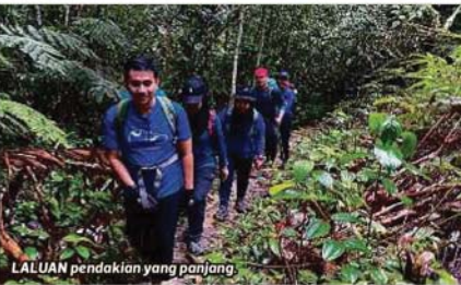
LALUAN pendakian yang panjang