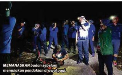
MEMANASKAN badan sebelum memulakan pendakian di awal pagi.

Puncak Gunung Besar Hantu berjaya ditawan sekitar jam 1 tengah hari selepas tempuh pelbagai rintangan