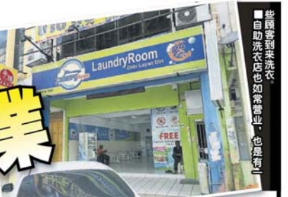
■自助洗衣店也如常營業，也是有一。

隨著許多商店和工業區都關閉沒有營業，許多大道和主要道路都出現車輛大減的情況，尤其是在上班時段也沒有出塞車。 在雪蘭莪一帶的多條主要大道和主要公路，包括了白蘭大道、沙阿南大道、新底班大道、第二中環公路、甲洞路、古晉路、王宮路、孟沙路、新街場延長大道、陸佑路、蕉賴