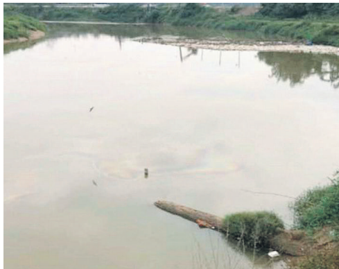
Pencemaran bau di Sungai Selangor menyebabkan empat loji rawatan air terpaksa dihentikan operasi kelmarin.

"Pensampelan kualiti air telah dilaksanakan bagi tujuan