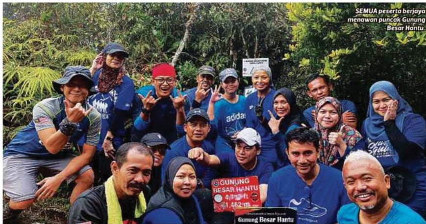
SEMUA peserta berjaya menawan puncak Gunung Besar Hantu.

Kem Sungai Kering adalah kem pertama untuk pendaki berehat dan di situ terdapat laluan anak sungai. Bolehlah menjadi sumber untuk berwujud