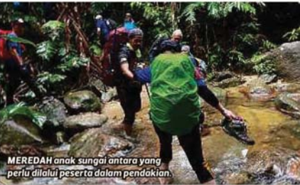
MEREDAH anak sungai antara yang perlu dilalui peserta dalam pendakian.