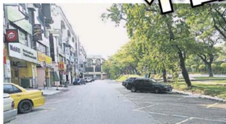
■在蒲種再也青那里商業區一帶，一些在上班時段也一位座位的路段，今日出現泊車位有空位的情況。 停業，从今日至31日都不可開攤營業。 但根據記者在吉隆坡半山巴巴剎觀察，半山巴巴剎有相當多露天小販營業如常營業，購物的人潮也相当多。 在蒲種再也早市巴剎，該露天巴剎的90%的小販沒有營業，只有蔬菜、魚販等如常營業。

露天小販須停業 一些小食店和小販中心相信是為避免不必要的情况，也在門外高掛橫幅，注明从今日(18日)至31日，只供“打包”或者是“外送”，不提供堂食。 銀行今日如常營業，許多公眾在早上9時就已在銀行外等待銀行的開門及辦理一些銀行事務。 至於一些外賣店，例如麦当劳等，雖然只是供得來速(PANDU LALU)方式點餐，也允許顧客進入店內點餐供“打包”，不允許堂食。 同時，一些飲料門市今日也是有開門營業，但也只供“外送”或者是“打包”帶走。 吉隆坡市政局和雪州的一些地方政府已于昨天發出通告，表明早市巴剎(露天)的小販必須要