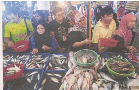
Filepic of customers at a night market in Shah Alam. Night markets are also not permitted for these two weeks.

Provided for client's internal research purposes only. May not be further copied, distributed, sold or published in any form without the prior consent of the copyright owner.