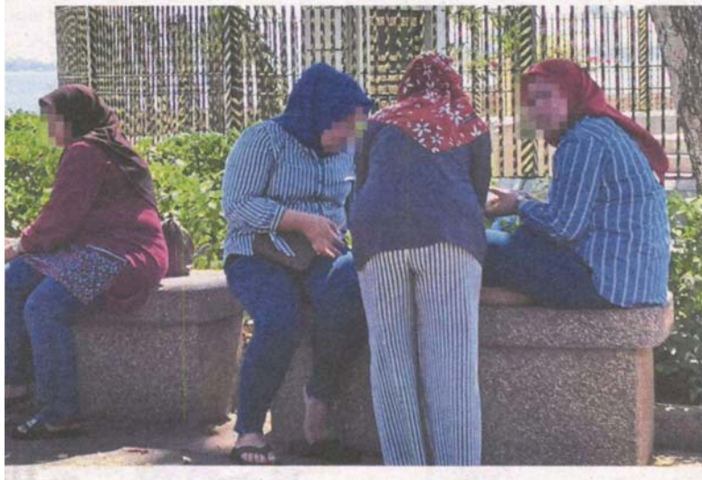
Oblivious to order: People gathering to eat at the promenade area near the Esplanade in George Town.