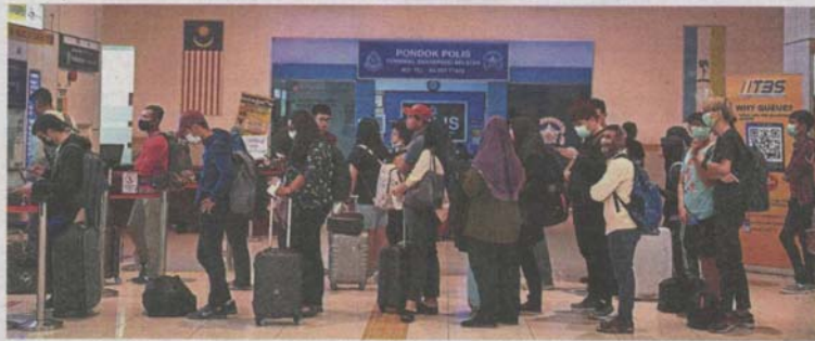
Long line: People queuing up at Terminal Bersepadu Selatan in Kuala Lumpur to buy bus tickets to go back to their hometowns.

Meanwhile, restaurants and other food outlets in the heart of George