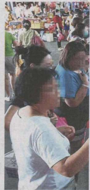
Still shopping: Customers buying