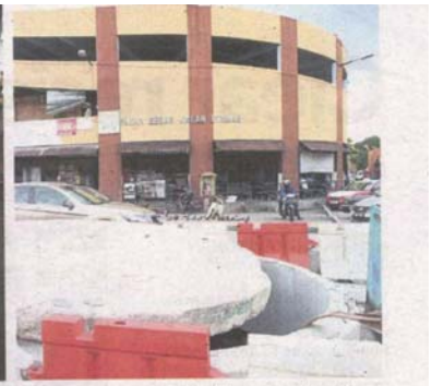
Wet markets housed in buildings are allowed to continue business.