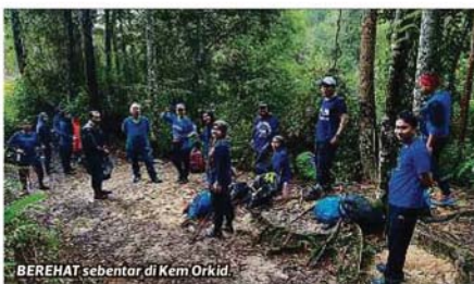
BEREHAT sebentar di Kem Orkid.

dan mengambil air untuk membanuh kopi pagi itu. Usai sekitar 30 minit berehat, perjalanan diteruskan. Dari air yang disangka embun, ia mula menjadi hujan lebat. Bagaimanapun, itu bukan penyebab untuk berpatah balik.