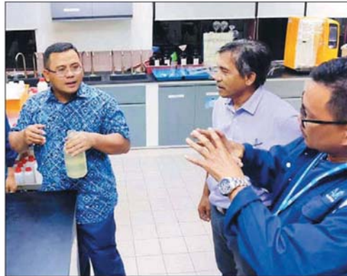
雪州大臣阿米鲁丁 (左) 周二深夜巡视滤水站, 聆听官员汇报有关滤水站污染的情况。

加埔, 预计将于今午6时全面恢复供水。雪州水务管理公司将会派送水槽车前往受影响地区, 尽